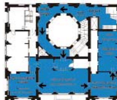
Primo piano / First floor