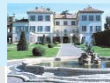
Villa Menafoglio Litta-Panza