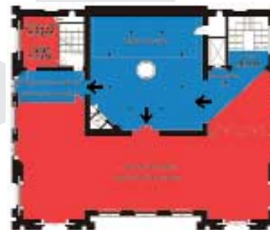
Secondo piano / Second floor